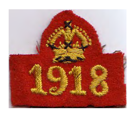
Guide and Ranger War Service, WW1

In 1940 all Rangers over the age of 15 were encouraged to work in the newly-formed Home Emergency Scheme (HES). The aim of the HES was to train girls "to help in meeting the needs of the country during wartime". The training demanded high standards of discipline, fitness and all-round usefulness and was the forerunner of the Rangers' Pre-Service Training. Qualified Rangers had their names entered on a register and were issued with an HES armband which they wore for the duration of the war.