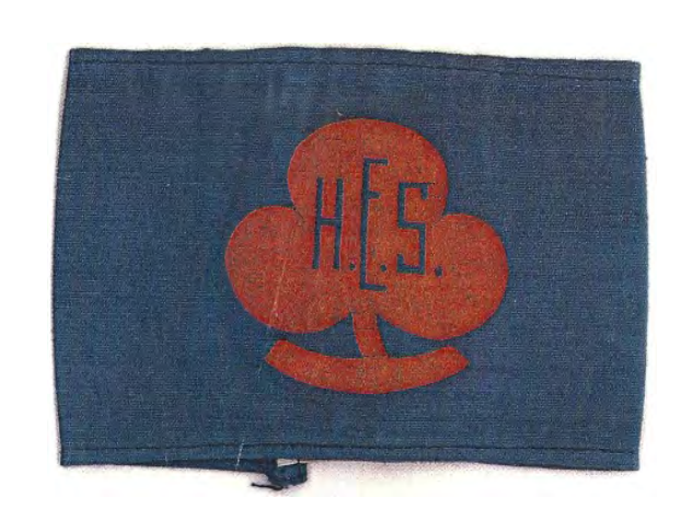
Ranger Home Emergency Service, WW2