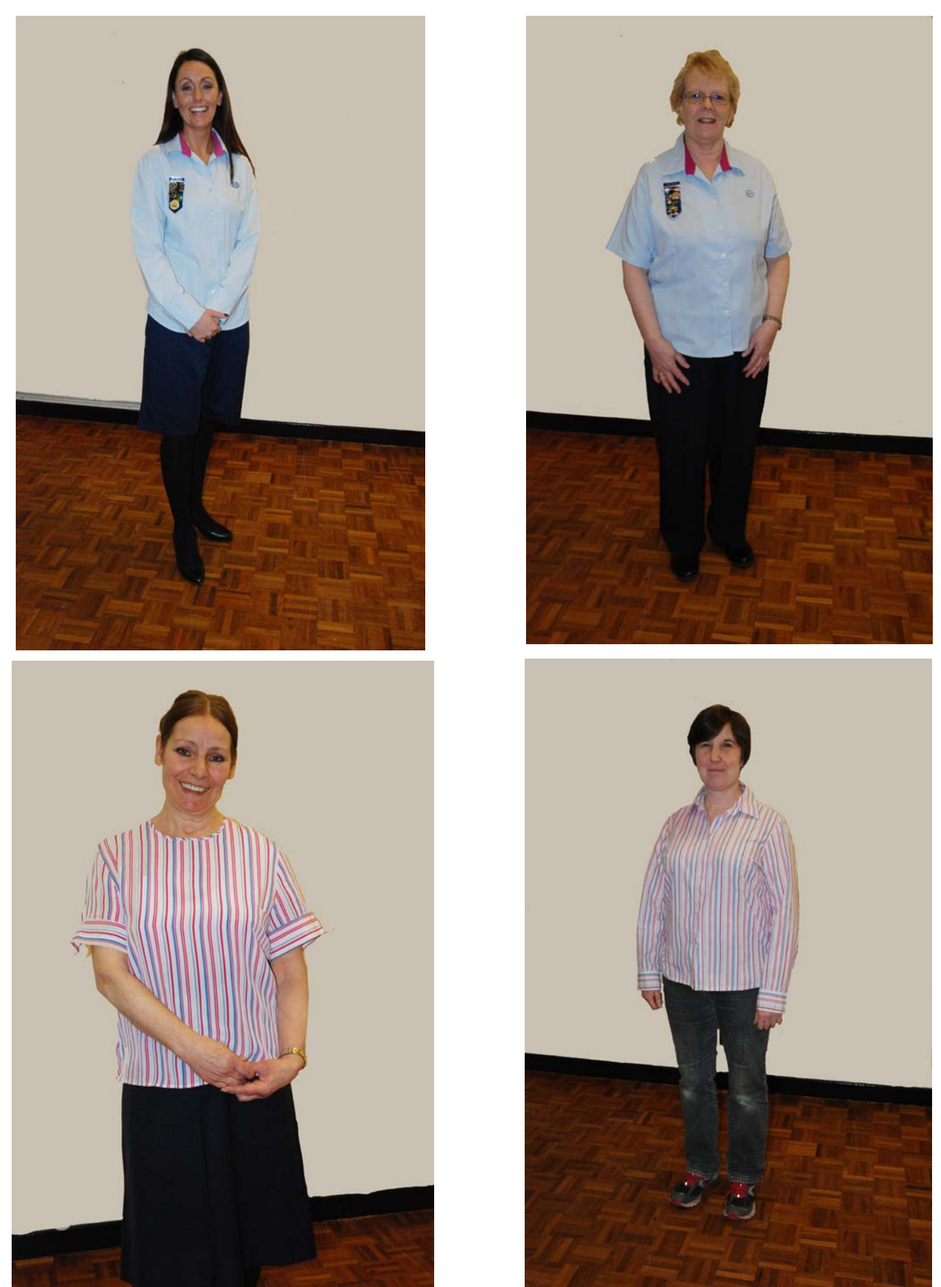
All data is as accurate as possible. POR and Guiding Manual have been used to verify dates and uniform changes.